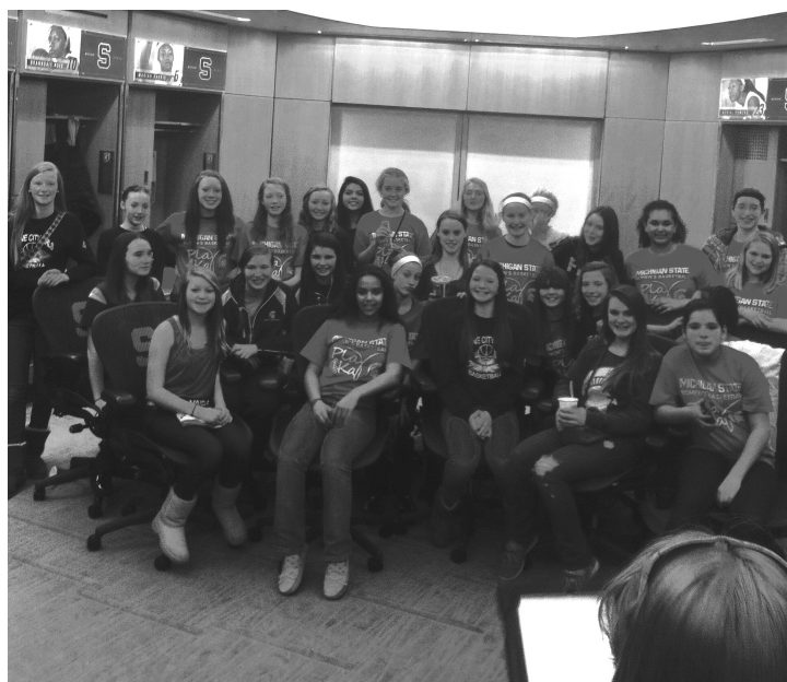
The Boyne City girls middle school basketball teams were invited to Michigan State University to attend a Lady Spartans victory over Ohio State on February 15. The Lady Ramblers shown here got a tour of the Spartan locker-room.