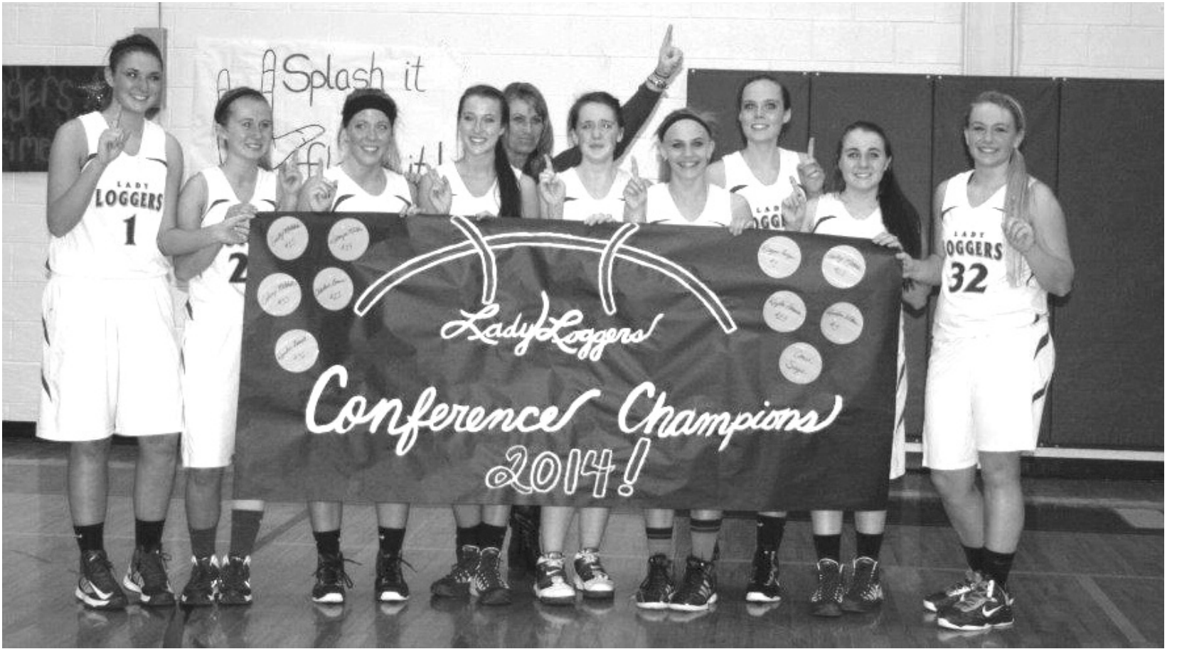
ABOVE: The Boyne Falls Lady Loggers proudly display their sign celebrating their first ever Northern Lakes Conference title.